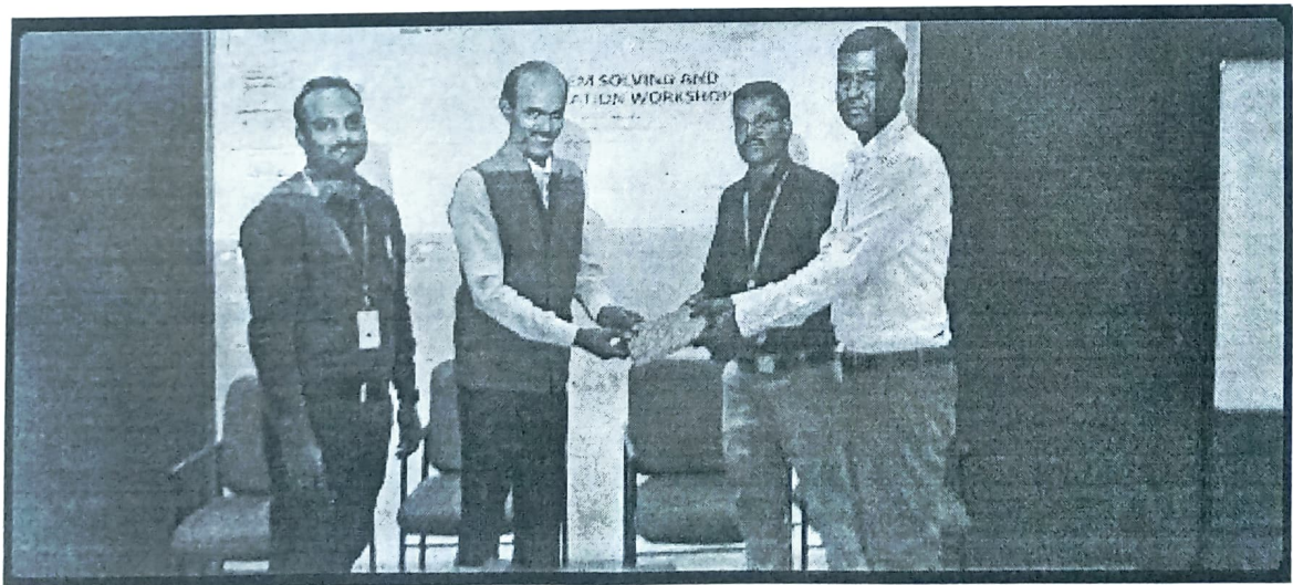
Honoring of Resource Person